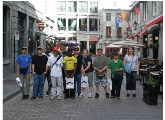
Class trip to Old Montreal, June 2012

Published by Storefront Schools and Communications and Information Services — October 2012